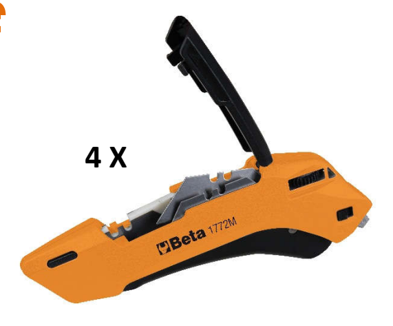
Adjustable cutting depth 5-25mm